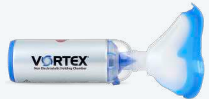
VORTEX with Adult Mask 4 years and up Part No.: 051F8300 HCPCS No.: A4627