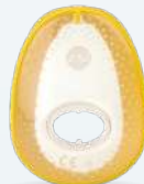
VORTEX Pediatric Mask, Med 1.5 - 4 years Part No.: 044F8200