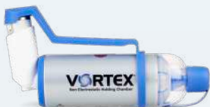
One-Handed Operation Aid Part No.: 044F5100