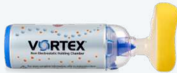
VORTEX with Pediatric Mask, Med 1.5 - 4 years Part No.: 051F8200 HCPCS No.: A4627