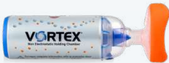
VORTEX with Pediatric Mask, Sm 0 - 1.5 years Part No.: 051F8100 HCPCS No.: A4627